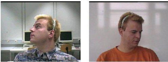
Figure 2: Two images of the same person taken in two rooms during data collection

We collected training data from nineteen persons in two different rooms with different lighting conditions. During data collection, users had to wear a head band with a sensor of a Polhemus pose tracker attached to it. Using the pose tracker, the head pose with respect to a magnetic transmitter could be collected in real-time. A camera was positioned approximately 1.5 meters in front of the users head. The user was asked to randomly look around in the room and the images together with the pose sensor readings were recorded. Figure 2 shows two sample images of the same user taken under different lighting conditions during data collection.