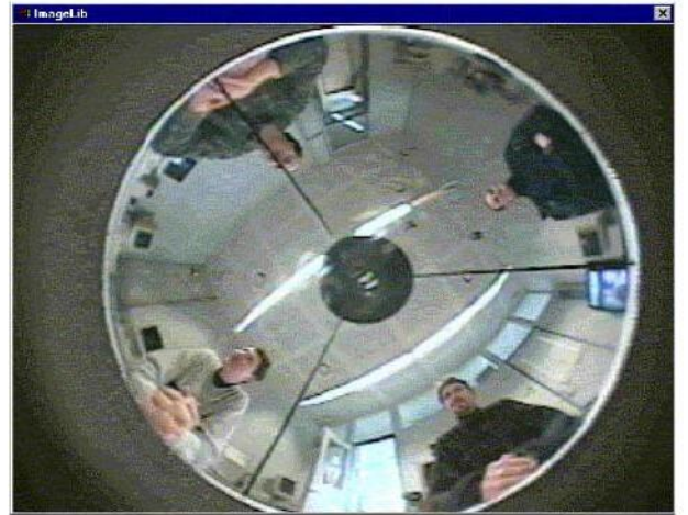
Figure 6: Meeting scene as captured with the panoramic camera

shows the rectified panoramic image (with faces marked) of the camera view depicted in Figure 6.