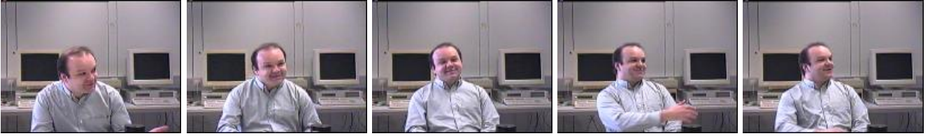
Figure 7: Sample sequence taken during a meeting