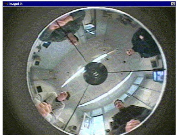
Figure 6: Meeting scene as captured with the panoramic camera

shows the rectified panoramic image (with faces marked) of the camera view depicted in Figure 6.