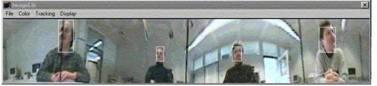
Figure 4: Panoramic view of the scene around the conference table. Faces are automatically detected and tracked (marked with boxes).

to be the face and consider the lower skin-like region to be hands. Figure 4 shows a sample panoramic image with the four found faces marked with white boxes. Note that the hands present in the panoramic view are not considered to be faces (and therefore not marked here).