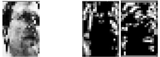
Figure 3: Preprocessed images: normalized grayscale, horizontal edge and vertical edge image (from left to right)

Figure 3 shows the corresponding preprocessed facial images of a user. From left to right, the normalized grayscale image, the horizontal and vertical edge images of a user's face are depicted.