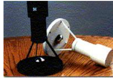
Figure 5: The panoramic camera used to capture the scene 1

shows the rectified panoramic image (with faces marked) of the camera view depicted in Figure 6.