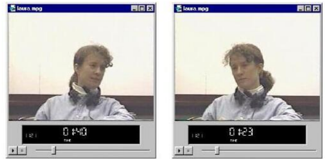
Figure 9: Examples in which the attention model indicates that the person is looking to the participant to the left and right, respectively

For gaze tracking, we have employed neural networks to estimate head pose from facial images. We have obtained mean error as small as 9 degrees for pan and 6 degrees for