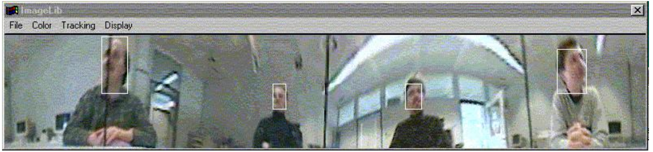
Figure 4: Panoramic view of the scene around the conference table. Faces are automatically detected and tracked (marked with boxes).

to be the face and consider the lower skin-like region to be hands. Figure 4 shows a sample panoramic image with the four found faces marked with white boxes. Note that the hands present in the panoramic view are not considered to be faces (and therefore not marked here).