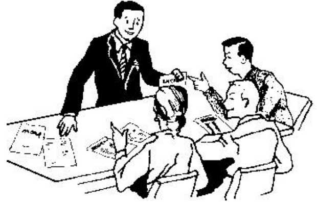
Figure 1: An example of interaction between people in a meeting

Hidden Markov Models can provide such an integrated framework for probabilistically interpreting observed signals