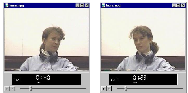
Figure 9: Examples in which the attention model indicates that the person is looking to the participant to the left and right, respectively

For gaze tracking, we have employed neural networks to estimate head pose from facial images. We have obtained mean error as small as 9 degrees for pan and 6 degrees for