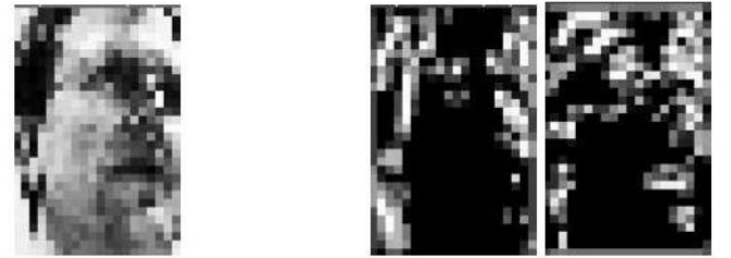
Figure 3: Preprocessed images: normalized grayscale, horizontal edge and vertical edge image (from left to right)

Figure 3 shows the corresponding preprocessed facial images of a user. From left to right, the normalized grayscale image, the horizontal and vertical edge images of a user's face are depicted.