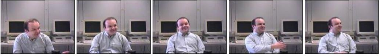
Figure 7: Sample sequence taken during a meeting