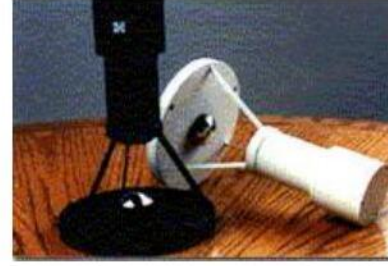
Figure 5: The panoramic camera used to capture the scene 1

We are using a panoramic camera with a 360 degree field of view that we put on top of the conference table to capture the whole scene around the table. Figure 5 shows a picture of the panoramic camera system that we are using. The camera is located in the top cylinder and is focusing on a parabolic mirror on the bottom plate. Through this mirror almost the entire hemisphere of the surrounding scene is visible. Figure 6 shows the view of a meeting scene as it is seen in the parabolic mirror and as it is captured with this camera. Since the topology of the mirror and the optical system are known, it is possible to compute rectified panoramic views of the scene as well as perspective views in different viewing directions. This can easily be done in real time. Figure 4