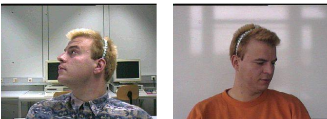
Figure 2: Two images of the same person taken in two rooms during data collection

We collected training data from nineteen persons in two different rooms with different lighting conditions. During data collection, users had to wear a head band with a sensor of a Polhemus pose tracker attached to it. Using the pose tracker, the head pose with respect to a magnetic transmitter could be collected in real-time. A camera was positioned approximately 1.5 meters in front of the users head. The user was asked to randomly look around in the room and the images together with the pose sensor readings were recorded. Figure 2 shows two sample images of the same user taken under different lighting conditions during data collection.