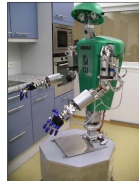
Fig. 1. Humanoid robot in the robot kitchen at the SFB 588 lab in Karlsruhe

Abstract —Future life pictures humans having intelligent humanoid robotic systems taking part in their everyday life. Thus researchers strive to supply robots with an adequate artificial intelligence in order to achieve a natural and intuitive interaction between human being and robotic system. Within the German Humanoid Project we focus on learning and cooperating multimodal robotic systems. In this paper we present a first cognitive architecture for our humanoid robot: The architecture is a mixture of a hierarchical three-layered form on the one hand and a composition of behaviour-specific modules on the other hand. Perception, learning, planning of actions, motor control, and human-like communication play an important role in the robotic system and are embedded step by step in our architecture.