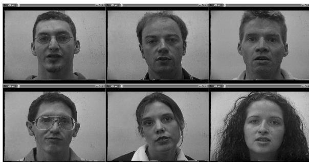
Fig. 1. Some pictures of the recorded faces taken from the videos.