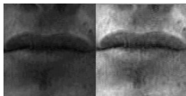
Fig. 2. The effects of the normalization of the brightness.

To compensate different illumination conditions and different skin tone of the subjects in the video images, we normalize the extracted mouth regions for brightness. A sample image is depicted in Figure 2.