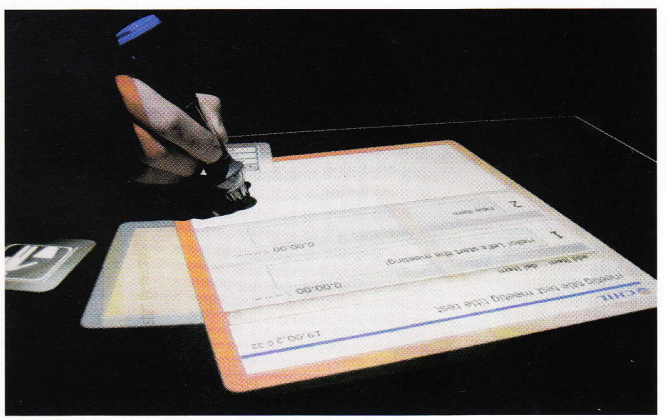
Figure 1: The Collaborative worksspace supports synchronous cooperation and participation by providing a shared information space and tools for managing face-to-face meeting.

Socially-Supportive Workspaces are an infrastructure for fostering cooperation among