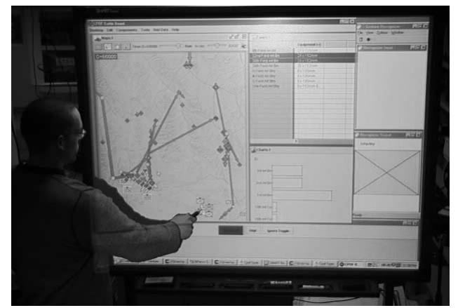
Figure 1: One of the authors working on Battleboard projected onto touch-sensitive SMARTBoard. Visible are the map view (left), a table and chart (center), and the iconic recognizer (bottom right).

Some important requirements for the command post of the future follow. Many of these requirements are also relevant to multi-modal systems for businesses and homes.